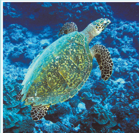
A turtle enjoys the warm waters around Bora Bora.