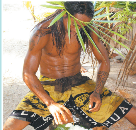
A local islander scrapes the meat out of a freshly acquired coconut.