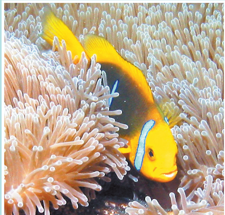
A clown fish protects its home anemone on the reef around Moorea.